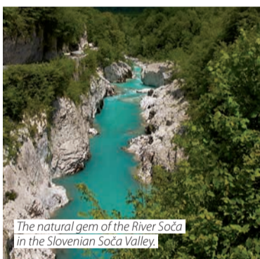
The natural gem of the River Soča in the Slovenian Soča Valley.