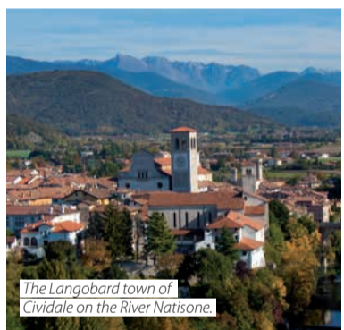
The Langobard town of Cividale on the River Natisone.