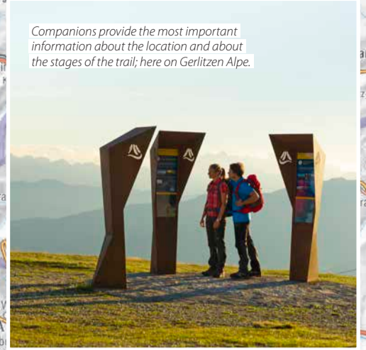
Companions provide the most important information about the location and about the stages of the trail, here on Gerlitzen Alpe.