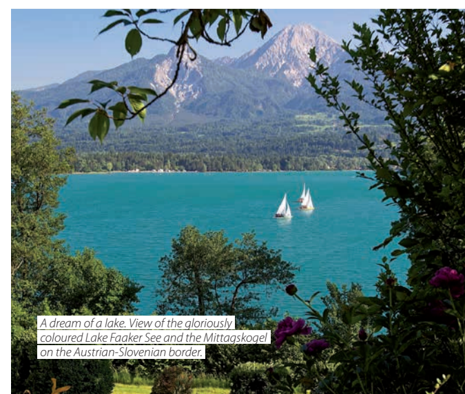
A dream of a lake. View of the gloriously coloured Lake Faaker See and the Mittagskogel on the Austrian-Slovenian border.