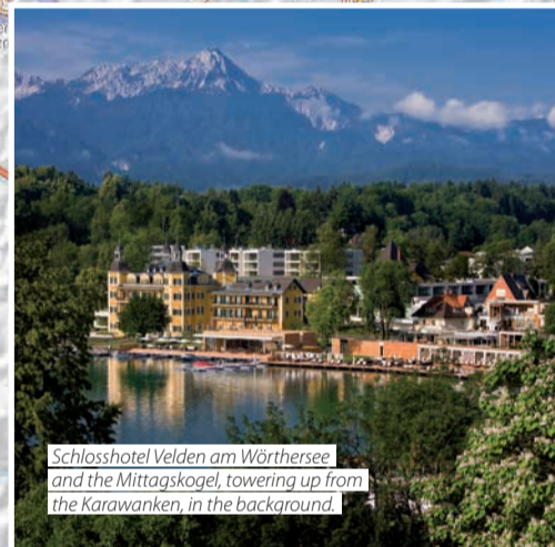
Schlosshotel Velden am Wörthersee and the Mittagskogel towering up from the Karawanken, in the background.