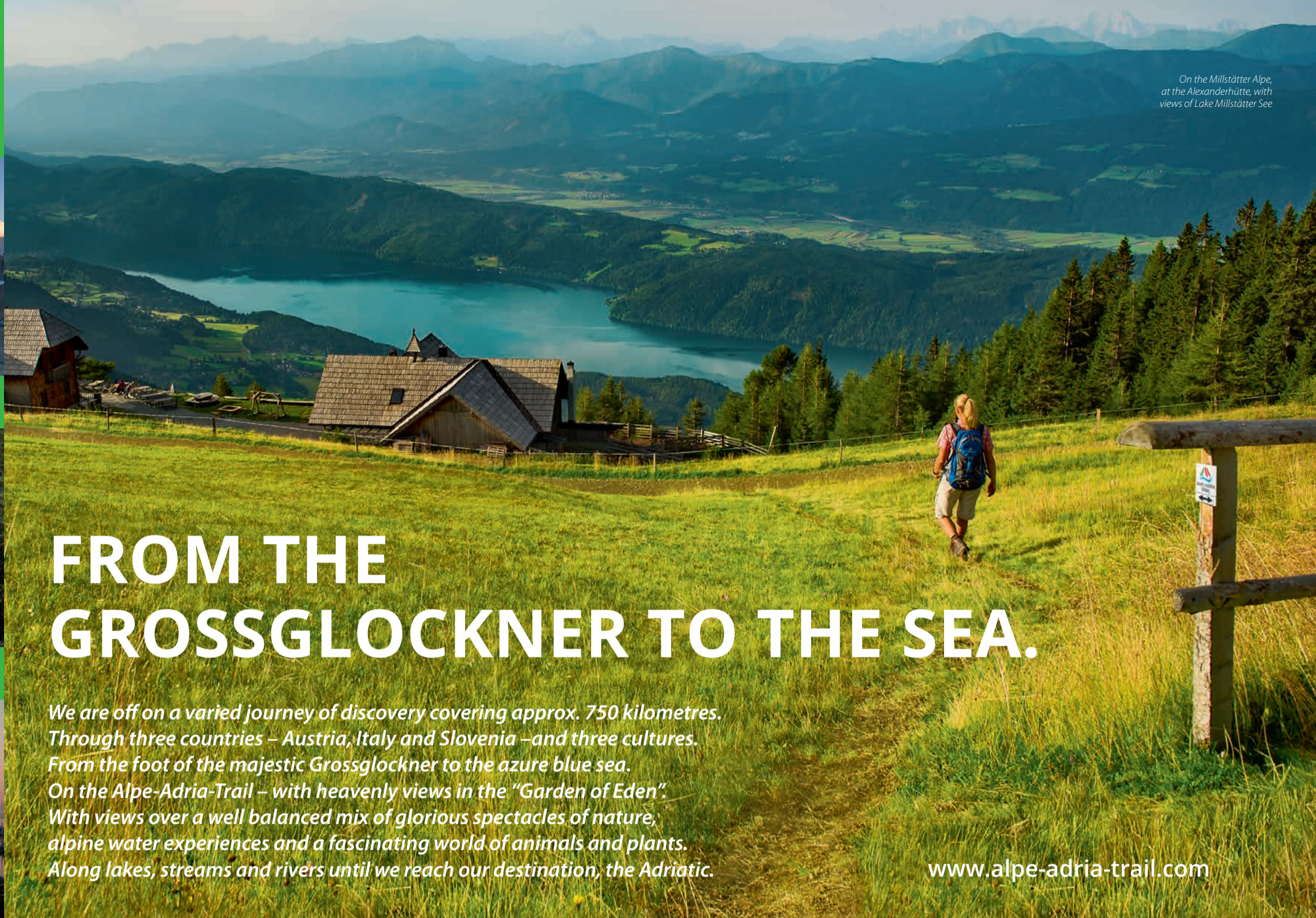
On the Millstätter Alpe, at the Alexanderhütte, with views of Lake Millstätter See