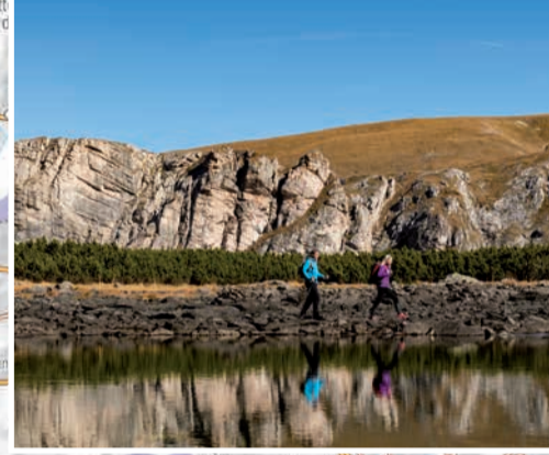
Hiking along crystal-clear mountain lakes in the Nockberge Biosphere Park.