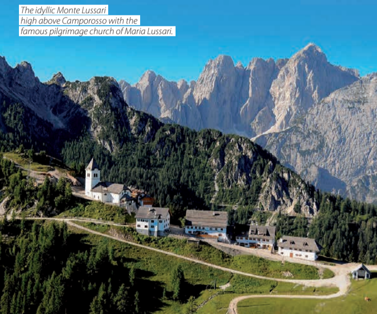
The idyllic Monte Lussari high above Camporosso with the famous pilgrimage church of Maria Lussari.