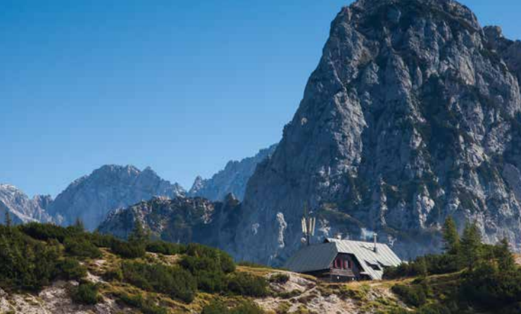
The Vršič Saddle (1,611 m) in the Triglav National Park is one of the most scenic Alpine passes in Slovenia.