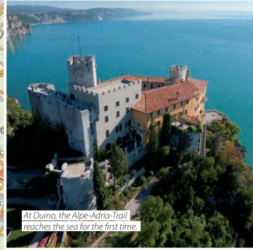
At Duino, the Alpe-Adria-Trail reaches the sea for the first time.