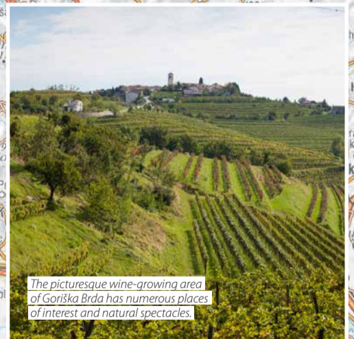
The picturesque wine-growing area of Goriška Brda has numerous places of interest and natural spectacles.